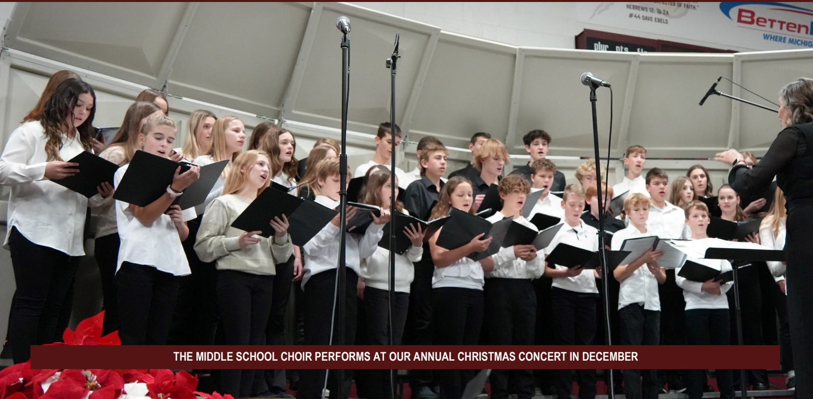
THE MIDDLE SCHOOL CHOIR PERFORMS AT OUR ANNUAL CHRISTMAS CONCERT IN DECEMBER